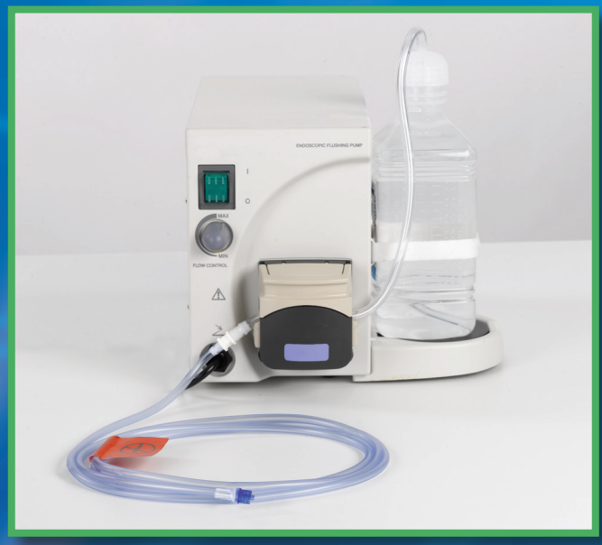
The Torrent® tubing is compatible with Olympus, ERBE, and EndoGator electric pumps.