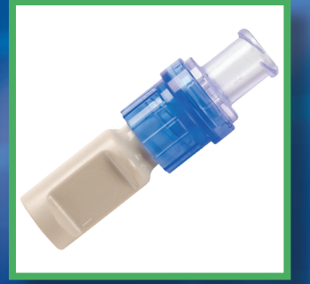
Torrent® scope connector for Olympus scopes