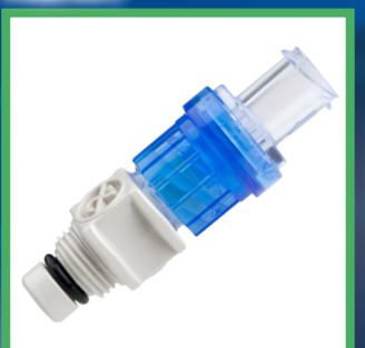
Torrent® scope connector for PENTAX scopes