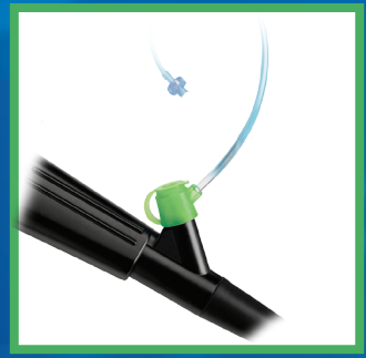
BioShield® irrigator for PENTAX scopes